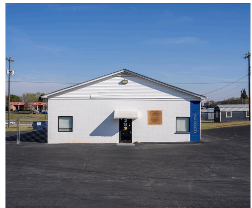
GREENVILLE COUNTY TAX MAP #M013020100900