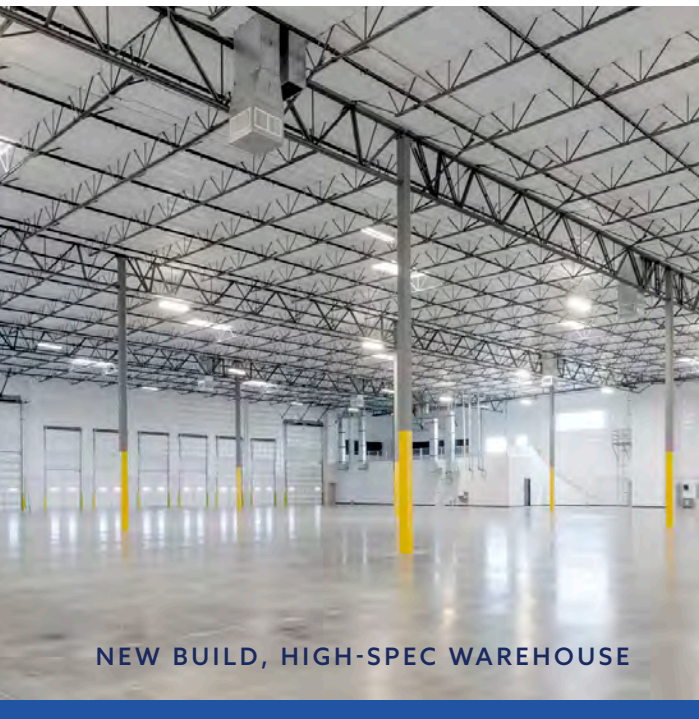
NEW BUILD, HIGH-SPEC WAREHOUSE