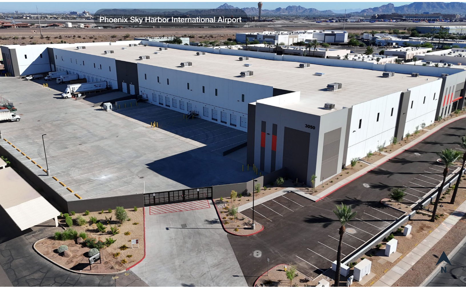
Phoenix Sky Harbor International Airport