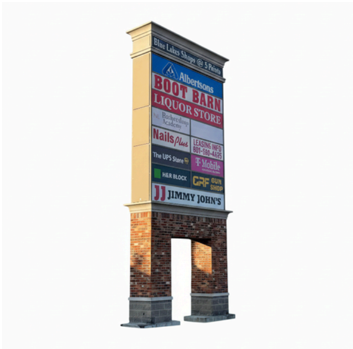
BLUE LAKES SHOPS @ 5 POINTS