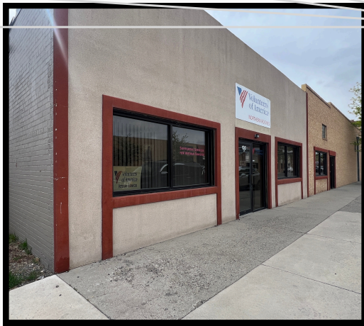
Veterans of America $2,000 a month