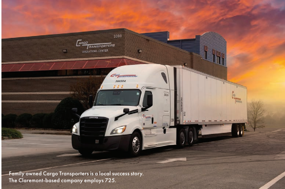
Family owned Cargo Transporters is a local success story. The Claremont-based company employs 725.

Catawba's EDC markets the area's proximity to Mecklenburg County, with the southern corner of Catawba at Killian Crossroads only 30 miles up N.C. 16 from Charlotte. Interstate 40 and U.S. 70 run east-west, through Claremont, Conover and Fairgrove to just below Hickory. U.S. 321 and N.C.16 run north-south. The county sits in the foothills of the Blue Ridge Mountains, where the Catawba River migrates above Hickory before turning south toward Lake Norman.