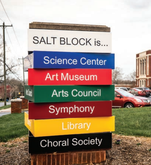
The SALT Block brings science, art and literature together.