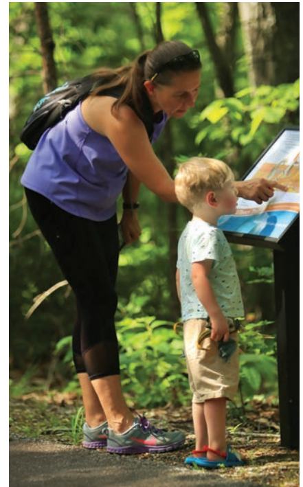
Hickory has added miles to its greenway system in recent years.