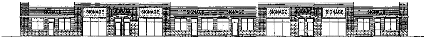
NORTH ELEVATION 1/8" = 1'-0"