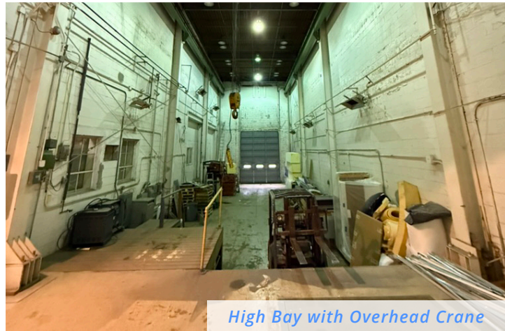
High Bay with Overhead Crane