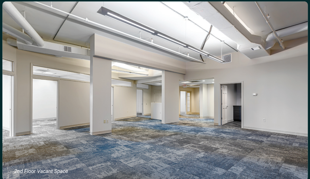
2nd Floor Vacant Space