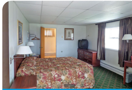
Sample Interior Room