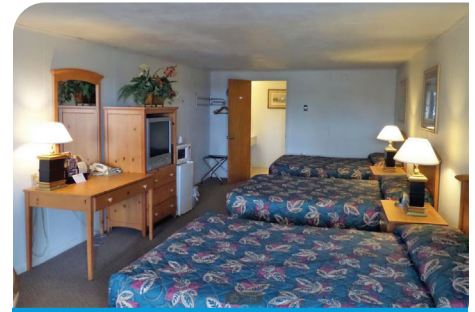
Sample Interior Room