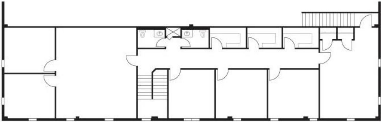
2nd floor layout