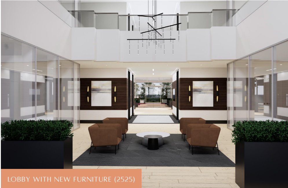
LOBBY WITH NEW FURNITURE (2525)