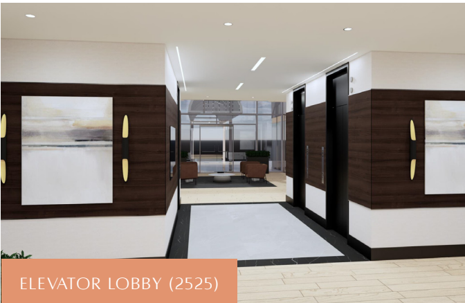
ELEVATOR LOBBY (2525)