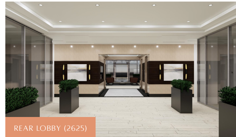
REAR LOBBY (2625)