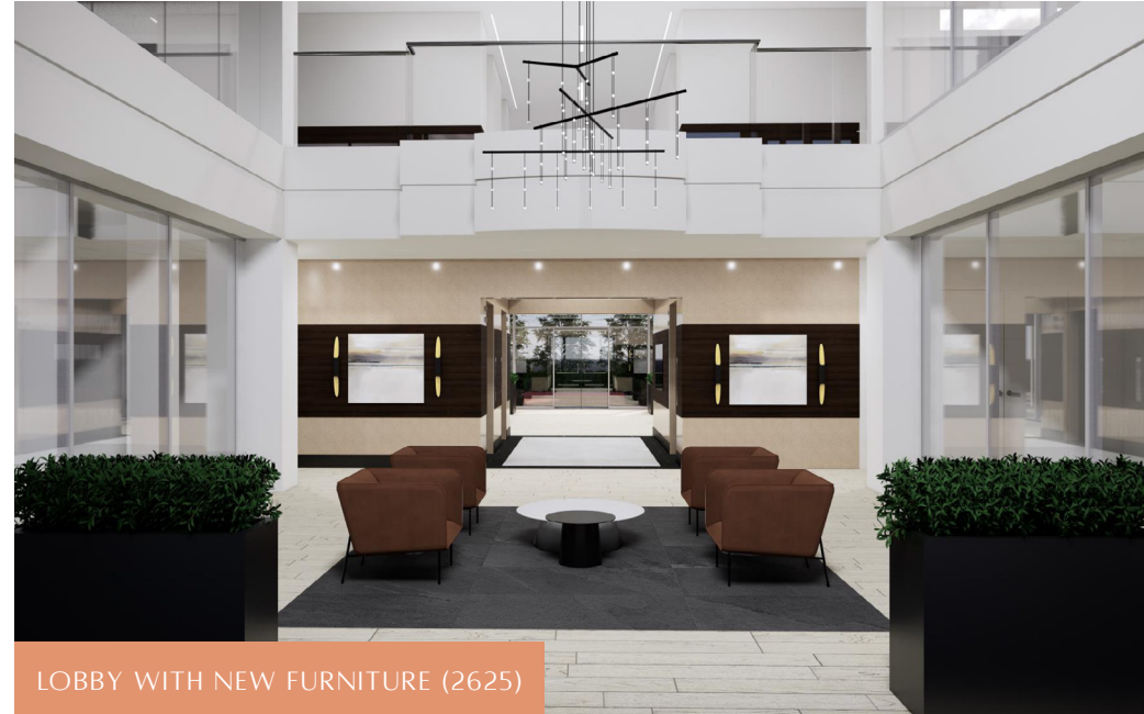
LOBBY WITH NEW FURNITURE (2625)