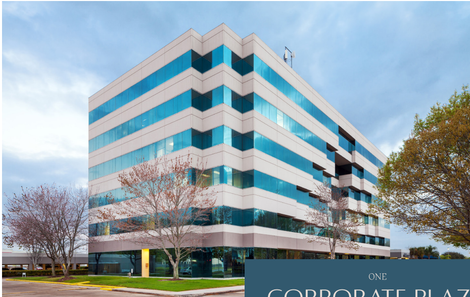
ONE CORPORATE PLAZA