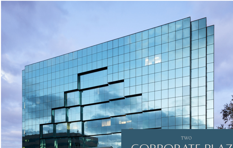
TWO CORPORATE PLAZA