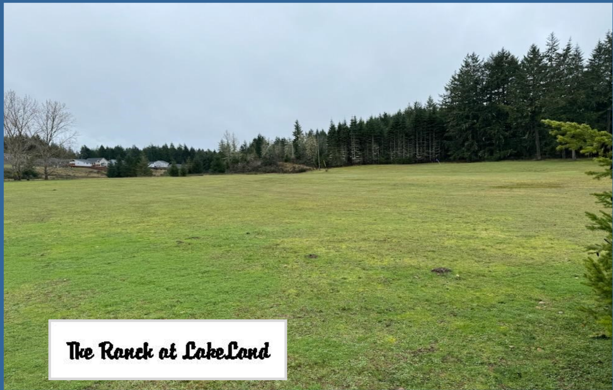
The Ranch at LakeLand

If you are ready for your next project, you have found the place! Come join in on The LakeLand Living Experience