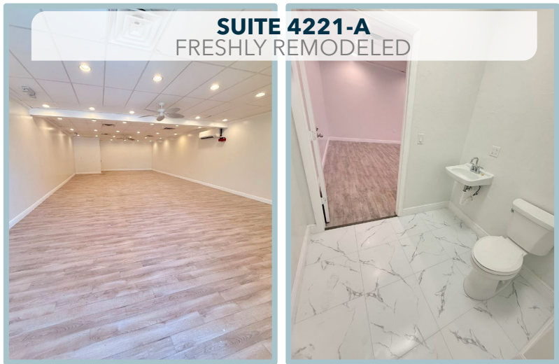
SUITE 4221-A FRESHLY REMODELED