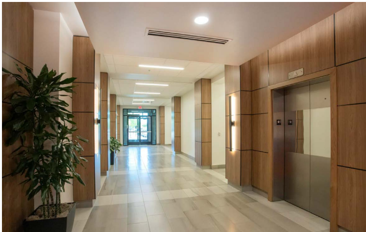
Interior lobby creates a welcoming experience for patients and guests.