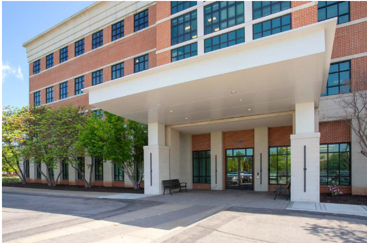
Exterior porte cochère enhances patient access.

Stonegate Center | 1639 Medical Center Pkwy | Murfreesboro, TN | 37129