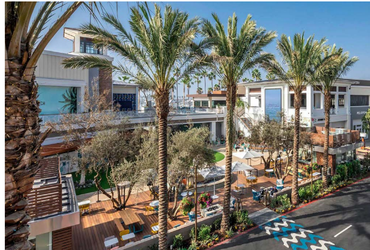
2ND & PCH