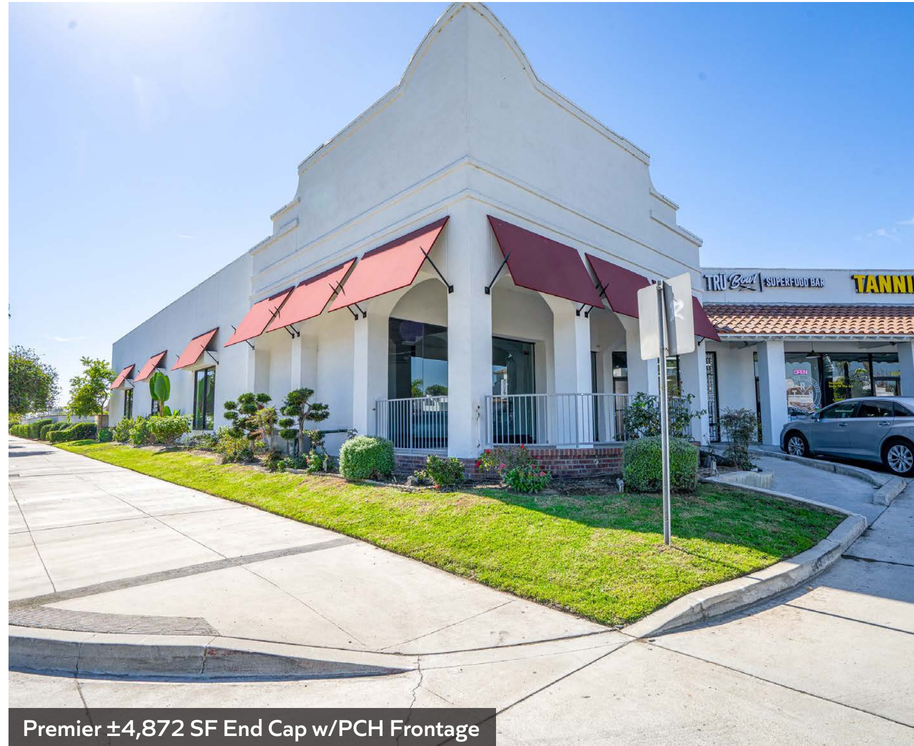
Premier ±4,872 SF End Cap w/PCH Frontage