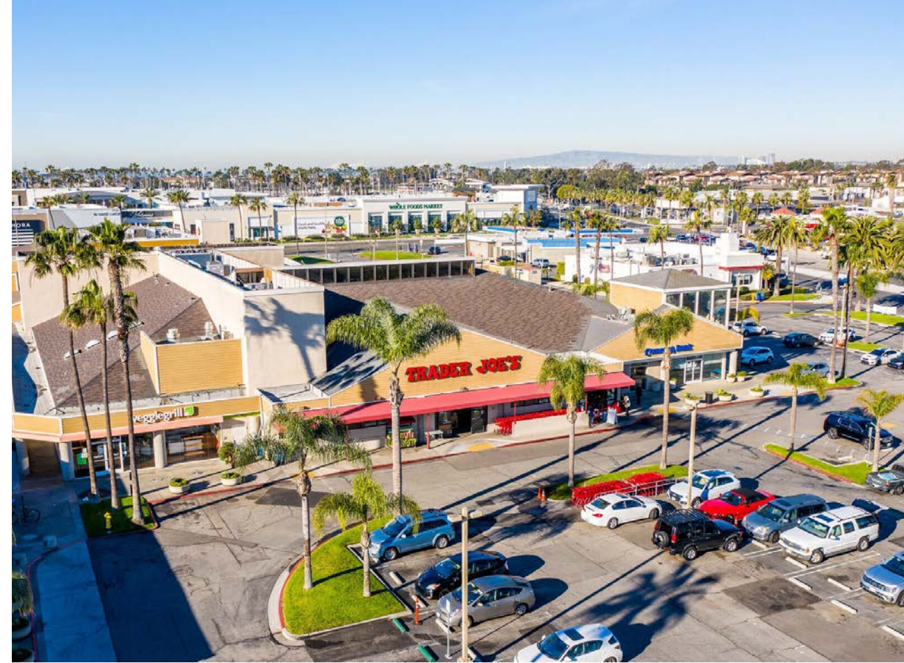
TRADER JOE'S / LONG BEACH MARKETPLACE

BELMONT SHORES NAPLES ISLAND LONG BEACH / CALIFORNIA