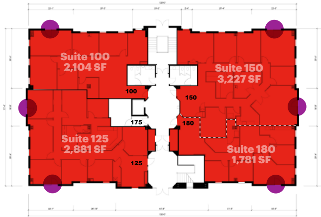
10293 - First Floor Plan Vacancies