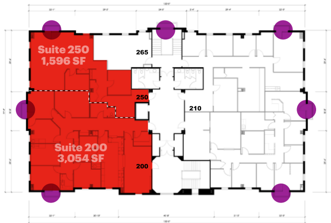
10293 - Second Floor Plan Vacancies