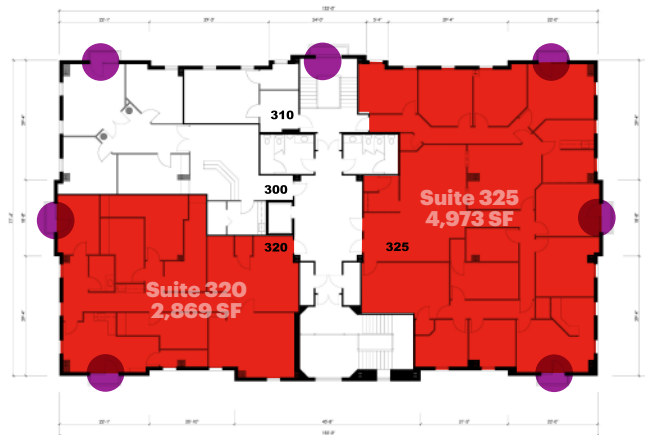
10293 - Third Floor Plan Vacancies