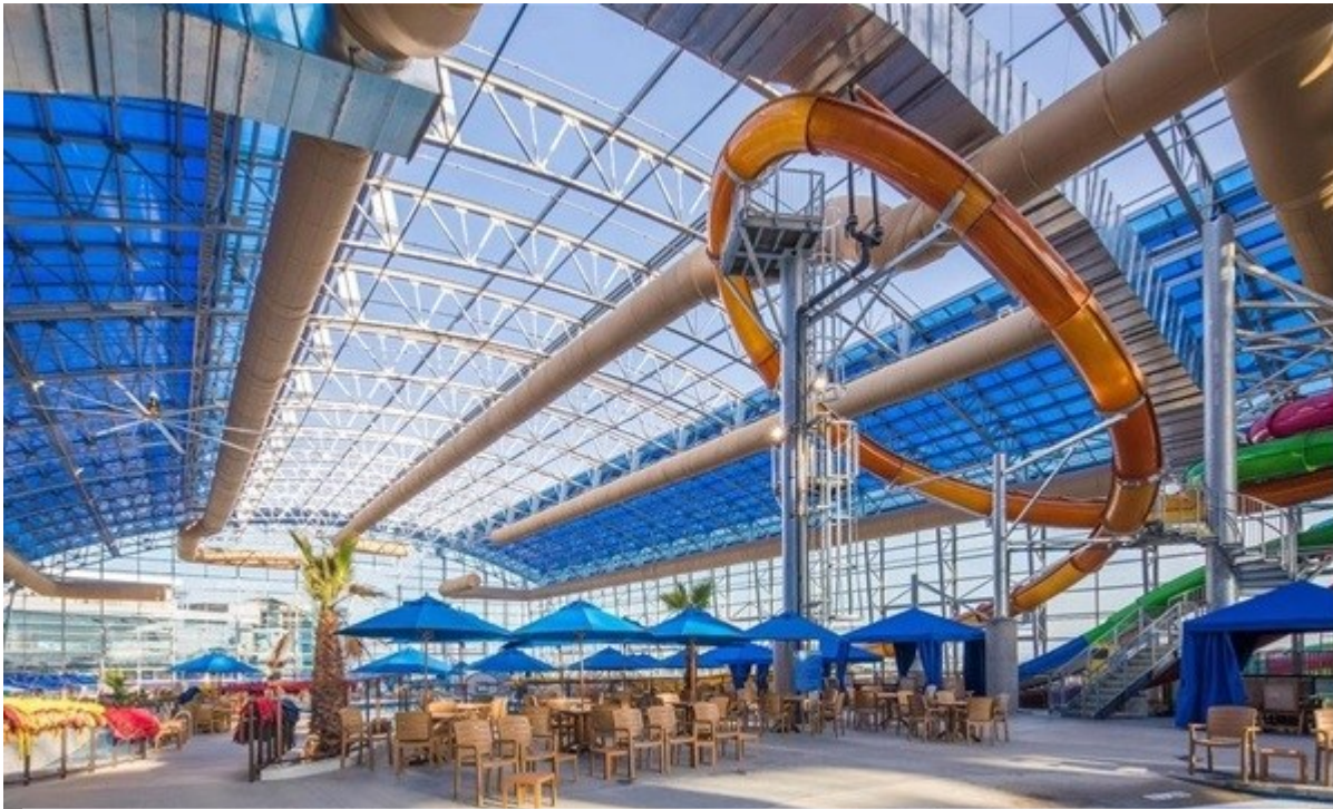
New 100,000 SF Indoor Water Park & 3 Hotels to Open in 2026 - 2 Mi From The Land For Sale