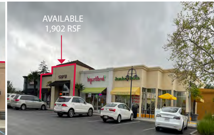
1,902 RSF Space