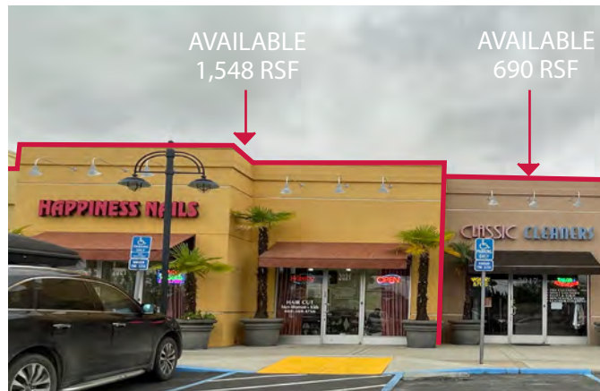
690 RSF Space & 1,548 RSF Space