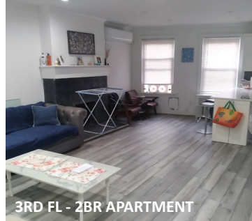
3RD FL - 2BR APARTMENT