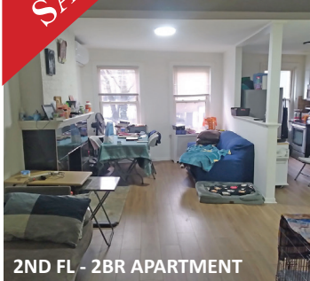
2ND FL - 2BR APARTMENT