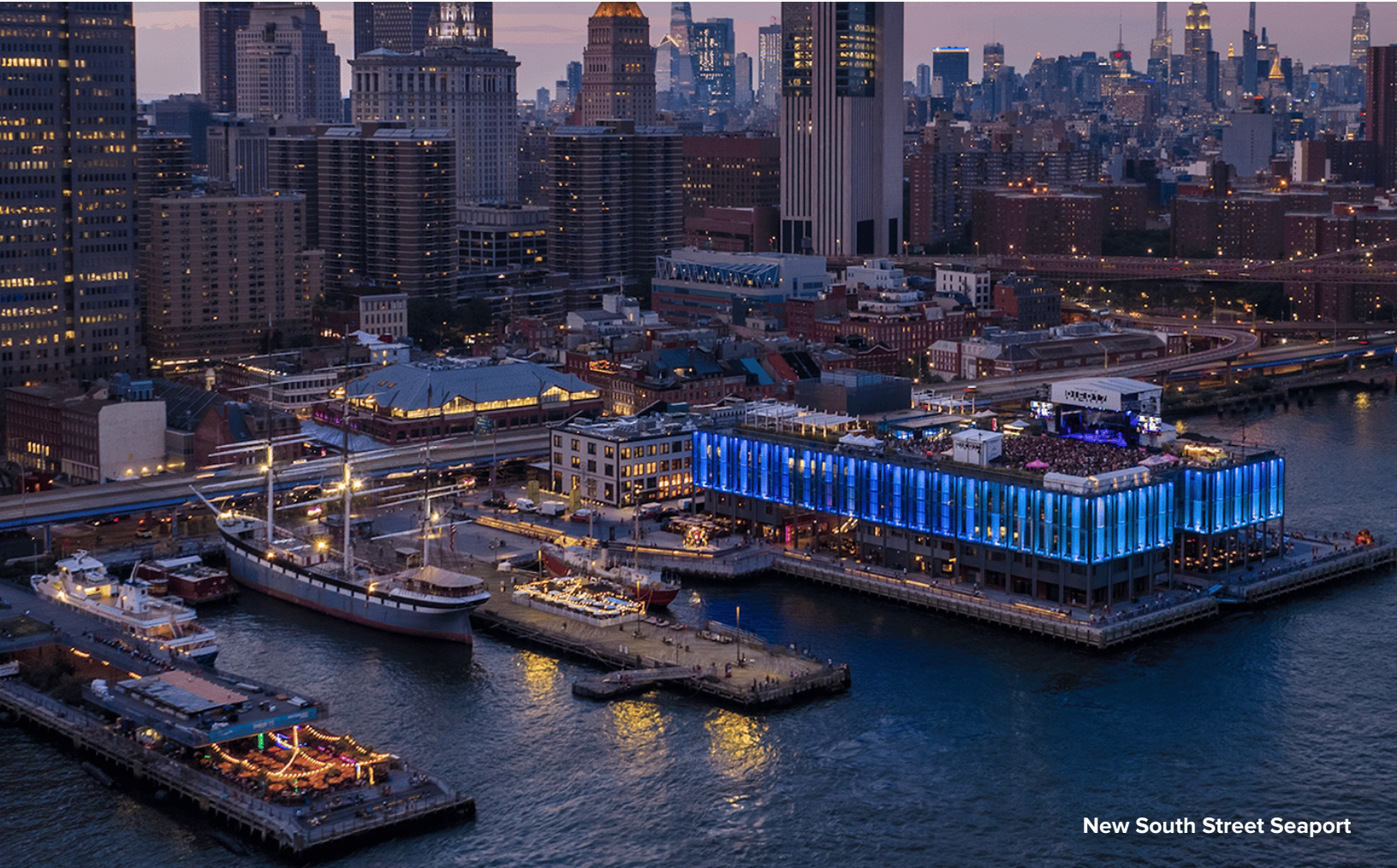
New South Street Seaport