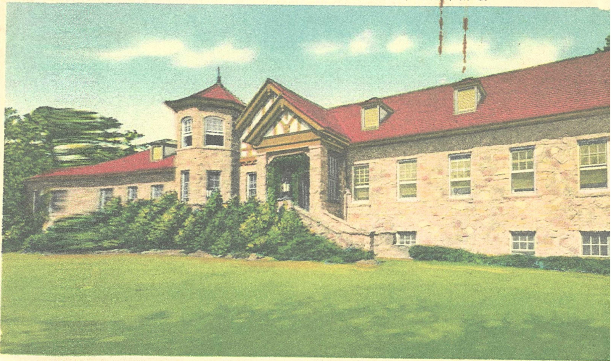
T-1 ST. LUKE'S HOSPITAL, TRYON, N. C.