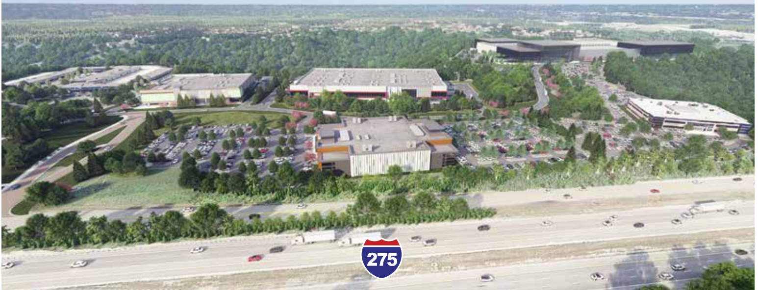
Conceptual Development Rendering

109 ACRES OF BUILD-TO-SUIT OPPORTUNITIES