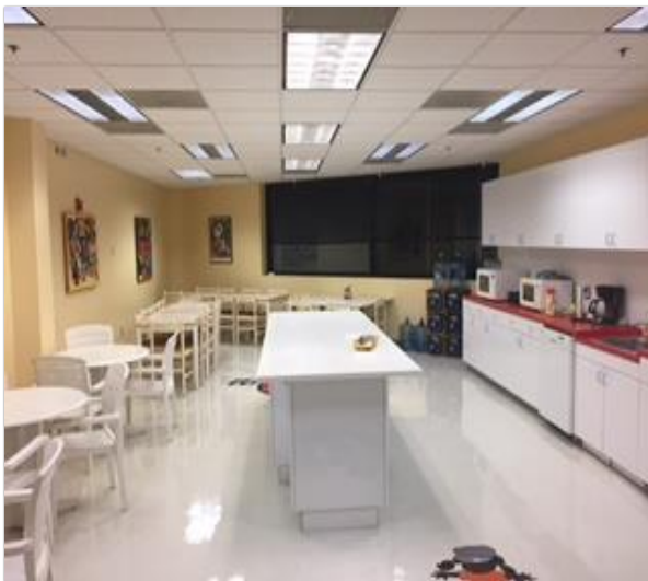
Figure 1- Large eat-in kitchen