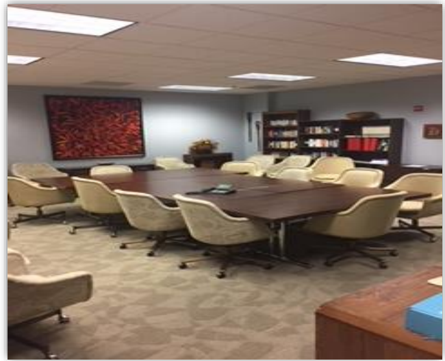
Figure 2 - Conference Room