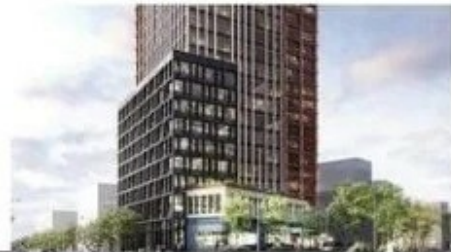
532 Summit | 25 stories | 340 units (Urby) Under construction Completion estimated end of 2023