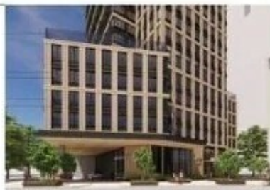
499 Summit | 53 stories | 600 units (Panepinto Properties) Construction to start early 2023 Completion estimated end of 2025