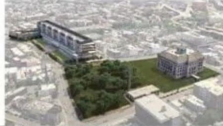
Hudson County Courthouse + Park Multiphase project Courthouse: under construction, completion estimated end of 2024 Park: Design started summer 2022