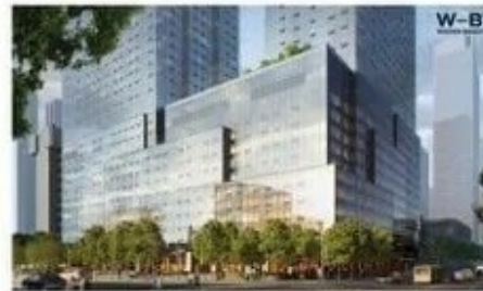
1 Journal Square | Two 64 story towers | 900 units (Kushner) Multiphase project Phase 1: broke ground June 2022, completion est. end of 2024