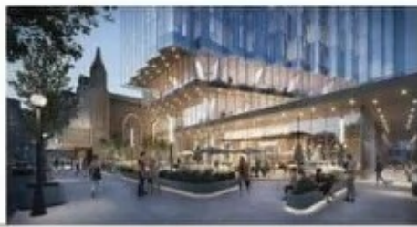
80 Journal Square | 28 stories | 400 units BH3 Management and Hope Street Capital