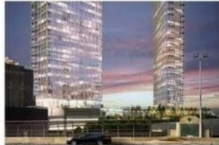
808 Pavonia | 52 stories | 1,200 units (KRE/Silverstein) Multiphase project Phase 1: estimated construction starts 1st Qtr 2023, completion estimated end of 2025