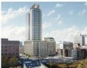
425 Summit Ave | 26 stories | 400 units (Spitzer Enterprises) Under construction Completion estimated end of 2024