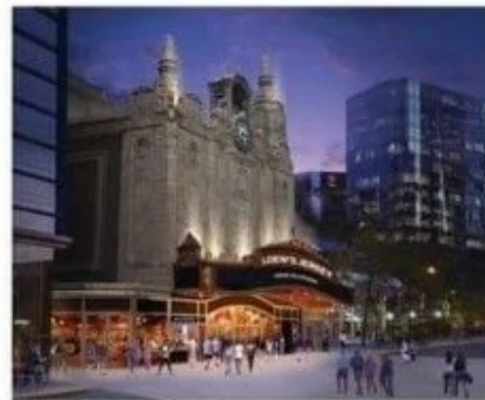
Loew's Theater | $72M renovations 3,330 seat performing arts center Anticipated opening: 2026