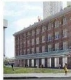
Pompidou x Jersey City World class museum Anticipated opening: 2026