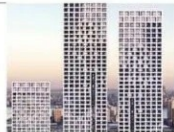
Journal Squared | 54,70,60 stories 1,200 units (KRE) Multiphase project Towers 1+2 completed Tower 3 completion est. 2023

Situated in the Journal Square Redevelopment Zone, this property presents a variety of possibilities for developers and investors. Its prime location near vibrant restaurants, schools, and businesses enhances its appeal, with potential for several additional floors pending variance approvals. The surrounding area has experienced significant growth in recent years, with multiple rental developments ranging from 29 to 132 units.