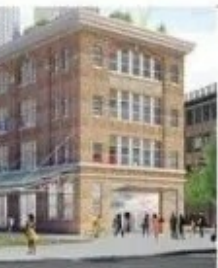
City m : 2026