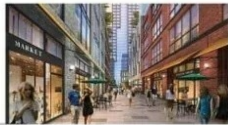
Homestead Place | 20-30 stories | ~3,000 units (Namdar Group, Lions Group, Oestricher/Nasser) Multiphase project 2 phases estimated complete in 2023