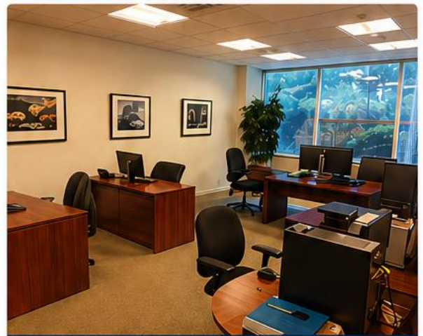
SPACIOUS & FUNCTIONAL OFFICE SPACE

Visible and convenient. Located between Wiehle Avenue and Hunter Mill Road Interchanges off Dulles Toll Road. Close to I-95 and the Fairfax County Parkway.