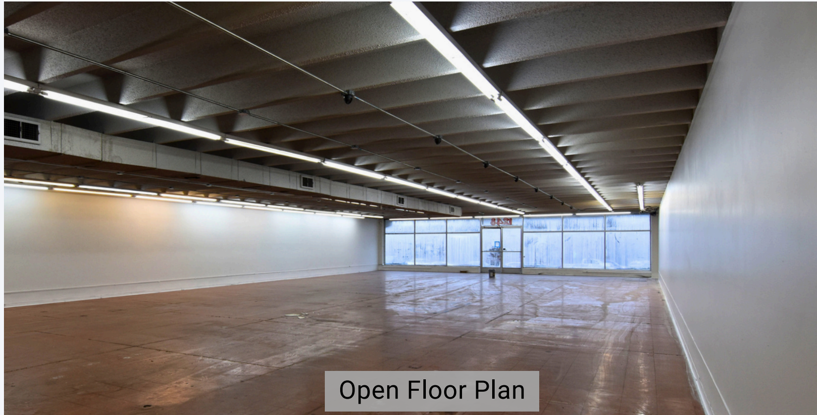
Open Floor Plan