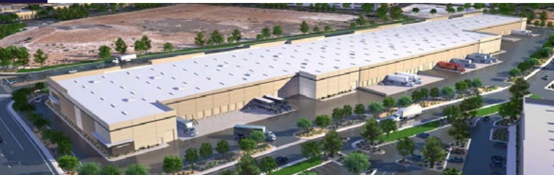
*Rendering View From the NW