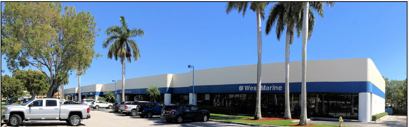
100-154 N. Federal HWY, Deerfield Beach, FL 33441