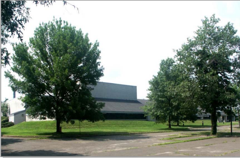
PHOENIX RESEARCH PARK

410 Sackett Point Road • North Haven, CT