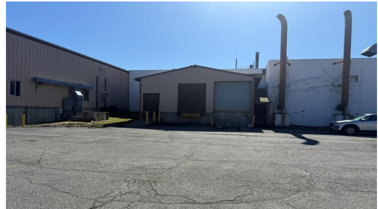
Loading Area - North wall of main section