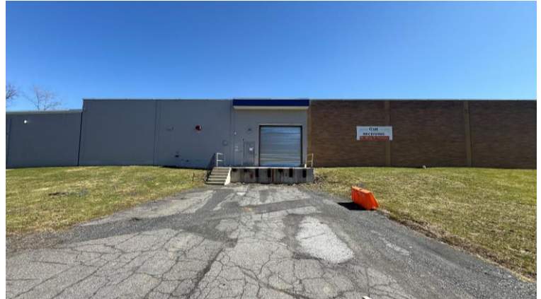
Loading Area – West wall of Main Section