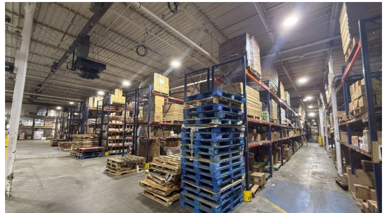
Industrial Area – Main Section – Existing racking