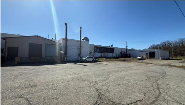
Loading Area – North wall