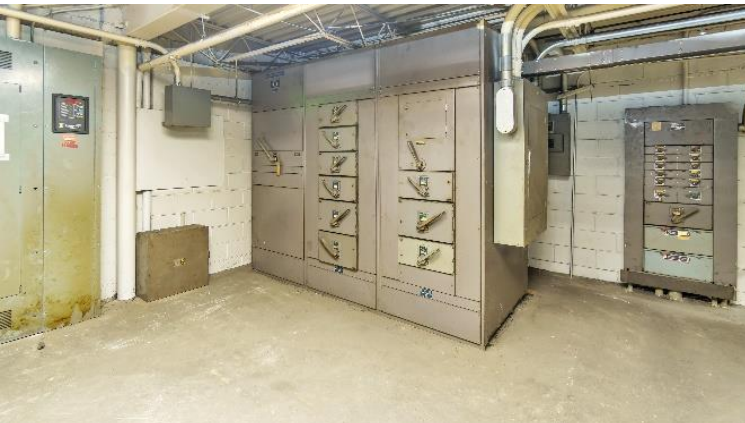
Heavy Electrical Service – 2000 amps