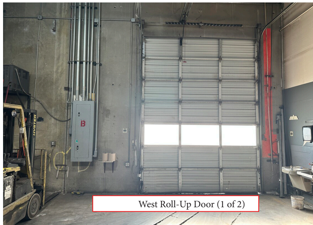
West Roll-Up Door (1 of 2)