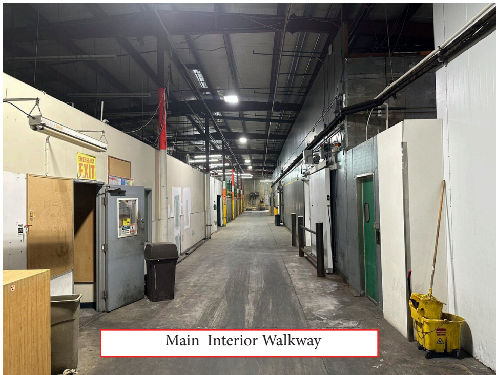
Main Interior Walkway