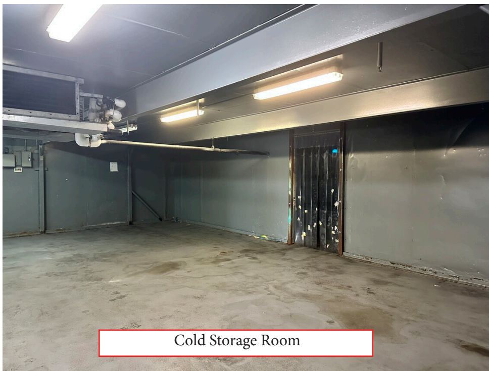
Cold Storage Room