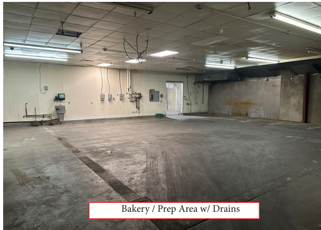
Bakery / Prep Area w/ Drains