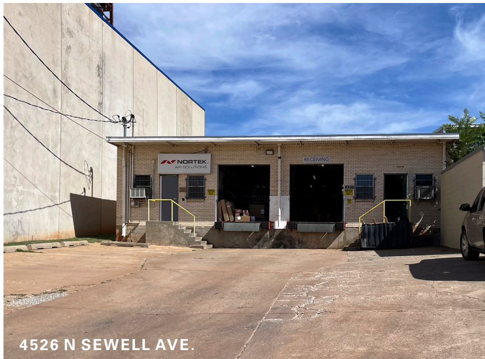
4526 N SEWELL AVE.