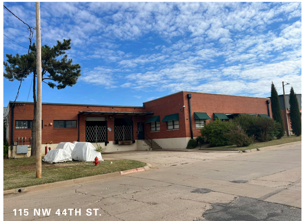
115 NW 44TH ST.