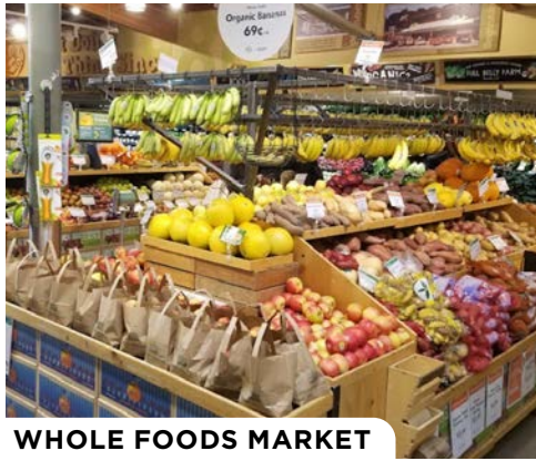
WHOLE FOODS MARKET