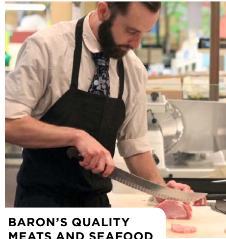
BARON'S QUALITY MEATS AND SEAFOOD