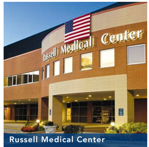
Russell Medical Center