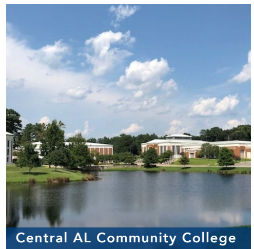
Central AL Community College