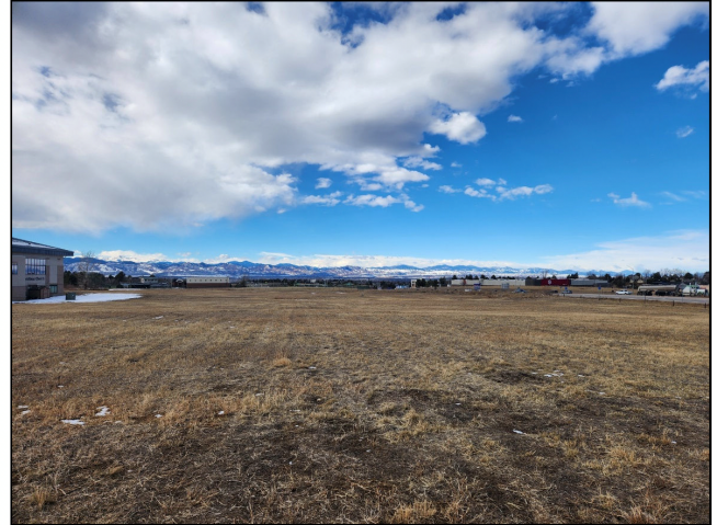
Looking west across the surplus land at the subject