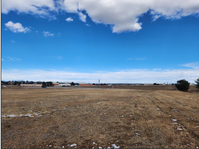
Looking north across the surplus land at the subject