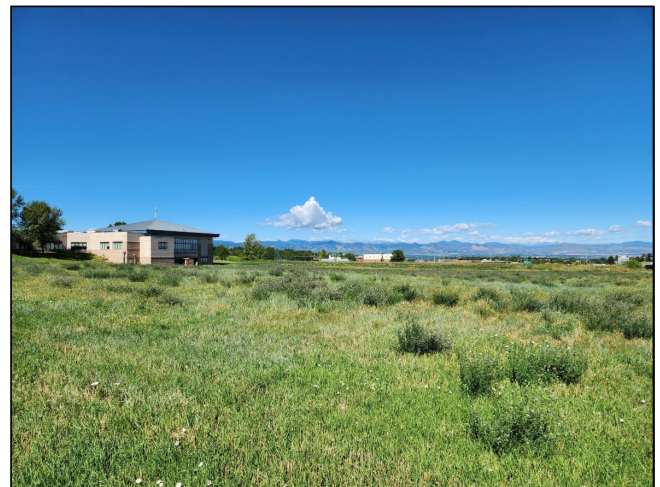
Looking southwest across the surplus land at the subject (8/2023 Photo)