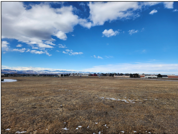
Looking northwest across the surplus land at the subject property