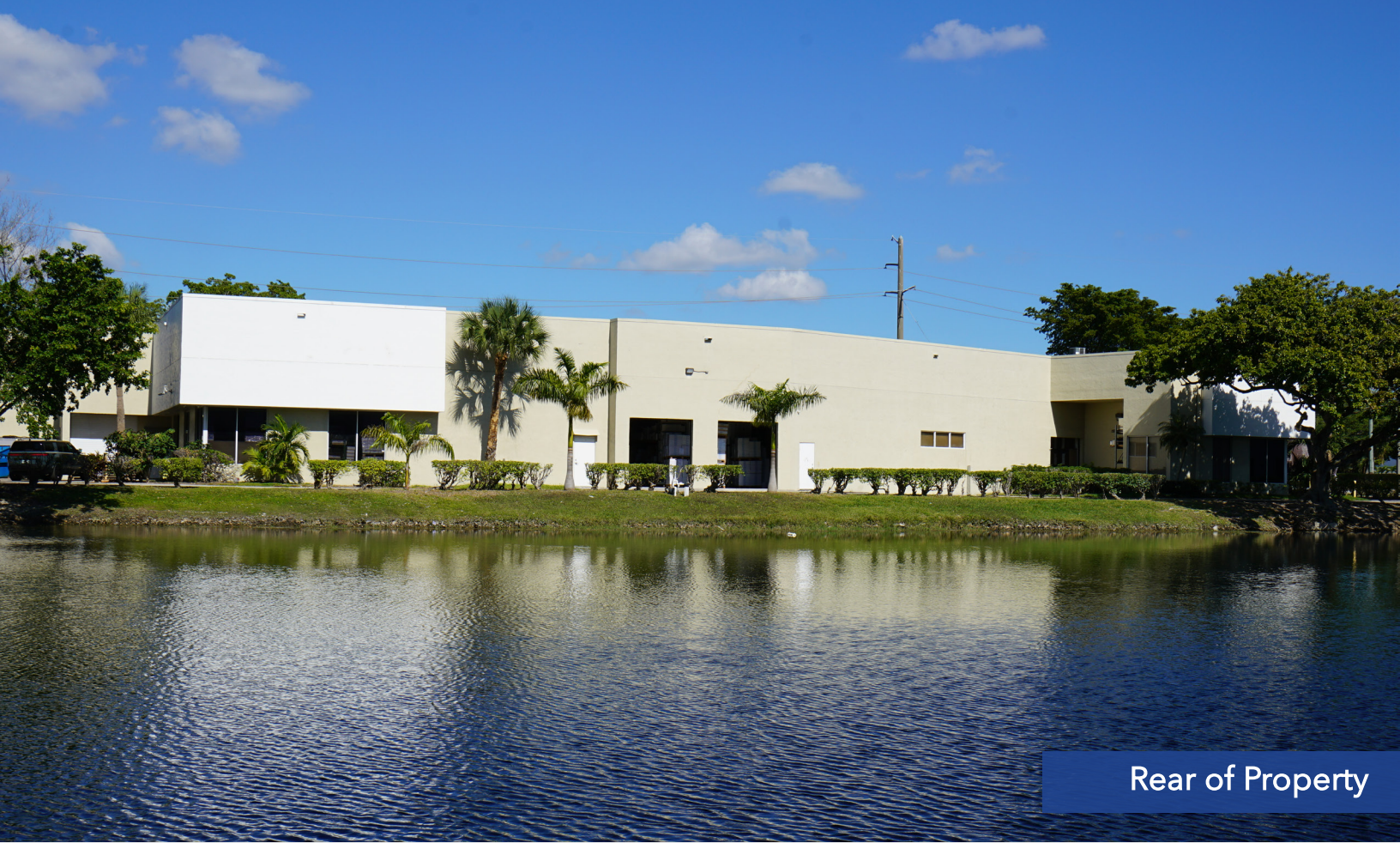
Rear of Property

2150 NW 33rd Street | Pompano Beach, FL 33069