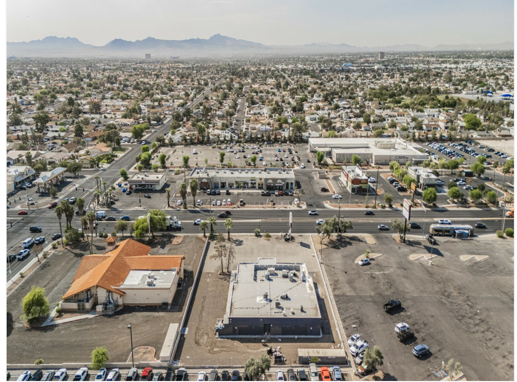
4550 E Charleston Blvd - 009