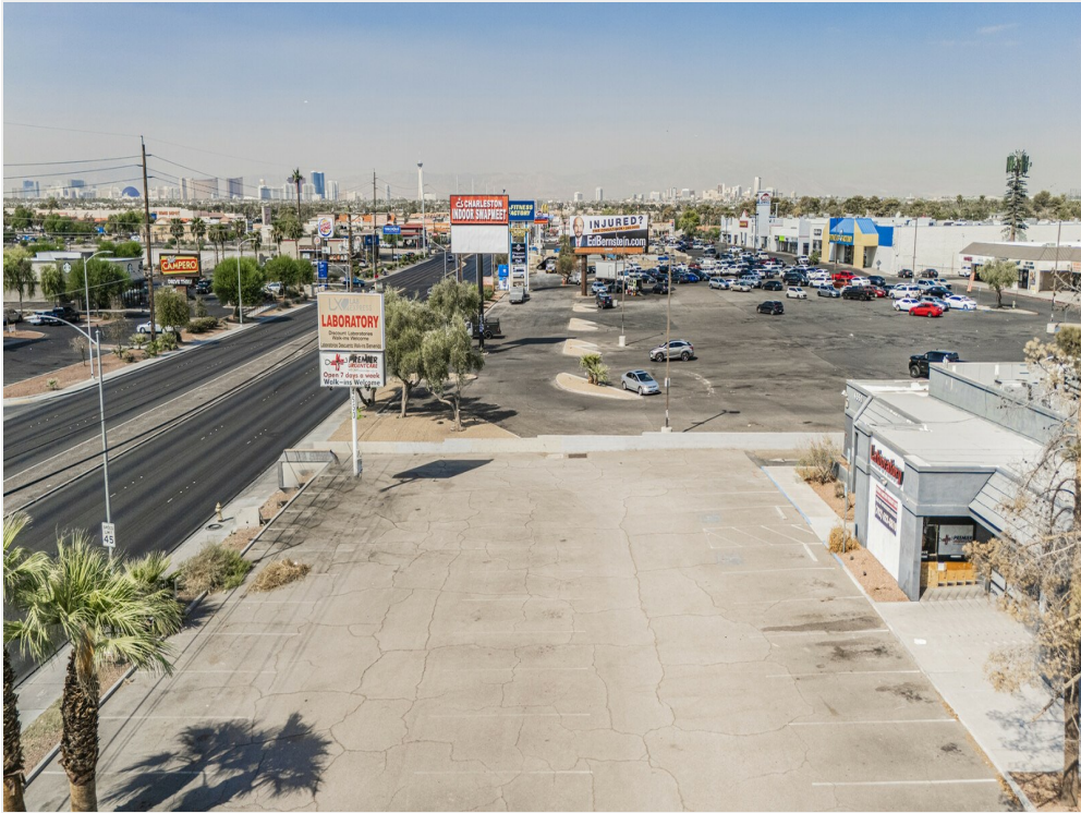
4550 E Charleston Blvd - 028