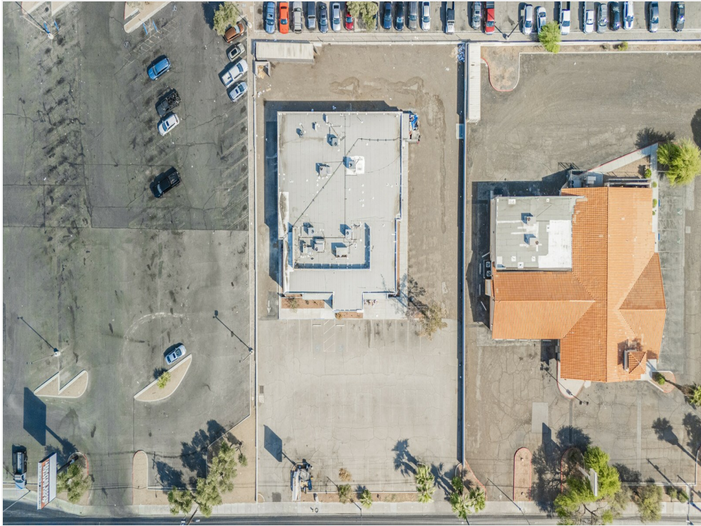
4550 E Charleston Blvd - 025