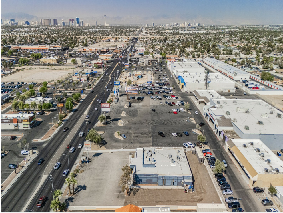
4550 E Charleston Blvd - 006