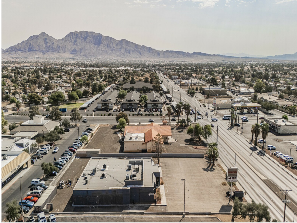
4550 E Charleston Blvd - 001