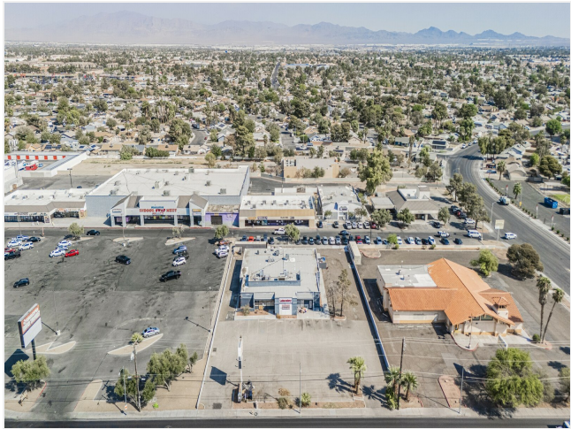
4550 E Charleston Blvd - 004

4550 E Charleston Blvd, Las Vegas, NV 89104