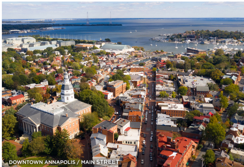
DOWNTOWN ANNAPOLIS / MAIN STREET