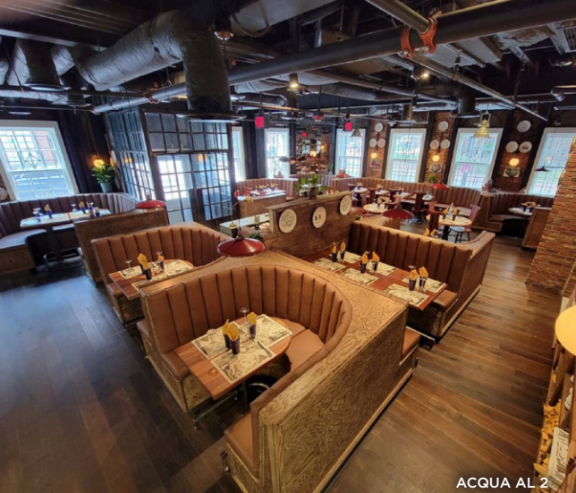
ACQUA AL 2