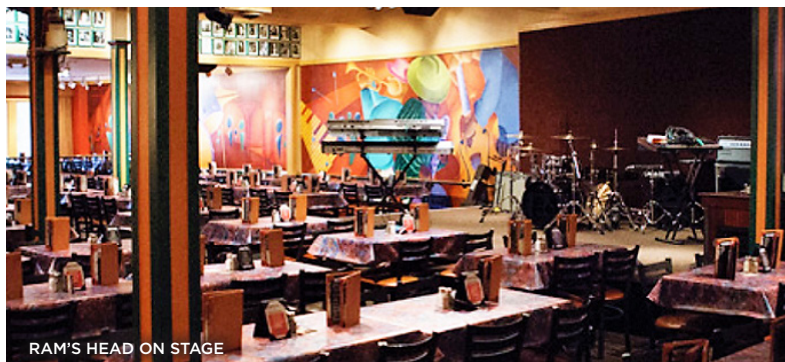
RAM'S HEAD ON STAGE

The top music club under 500 seats in the world! This beautiful smoke-free, seated nightclub offers an amazing array of national talent. Food and beverage served before and during show.