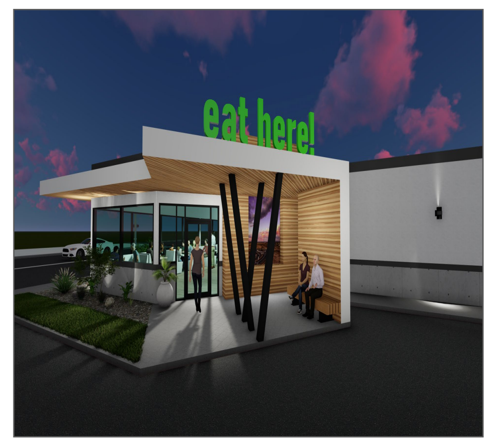
We obtained the information above from sources we believe to be reliable. However, we have not verified its accuracy and make no guarantee, warranty, or representation about it. It is submitted subject to the possibility of errors, omissions, change of price, rental or other conditions, prior sale, lease or financing, or withdrawal without notice. We include projections, opinions, assumptions, or estimates for example only, and they may not represent the current or future performance of the property. You and your tax and legal advisors should conduct your own investigation of the property and transaction.