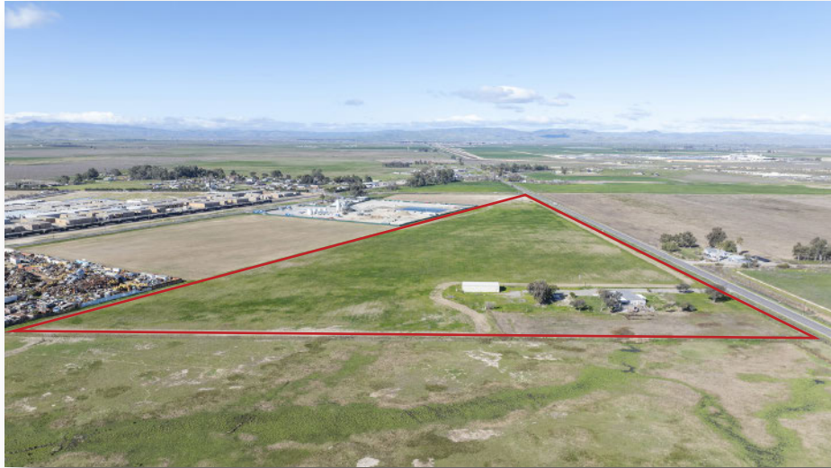
PHOTO GALLERY DRONE PHOTOS