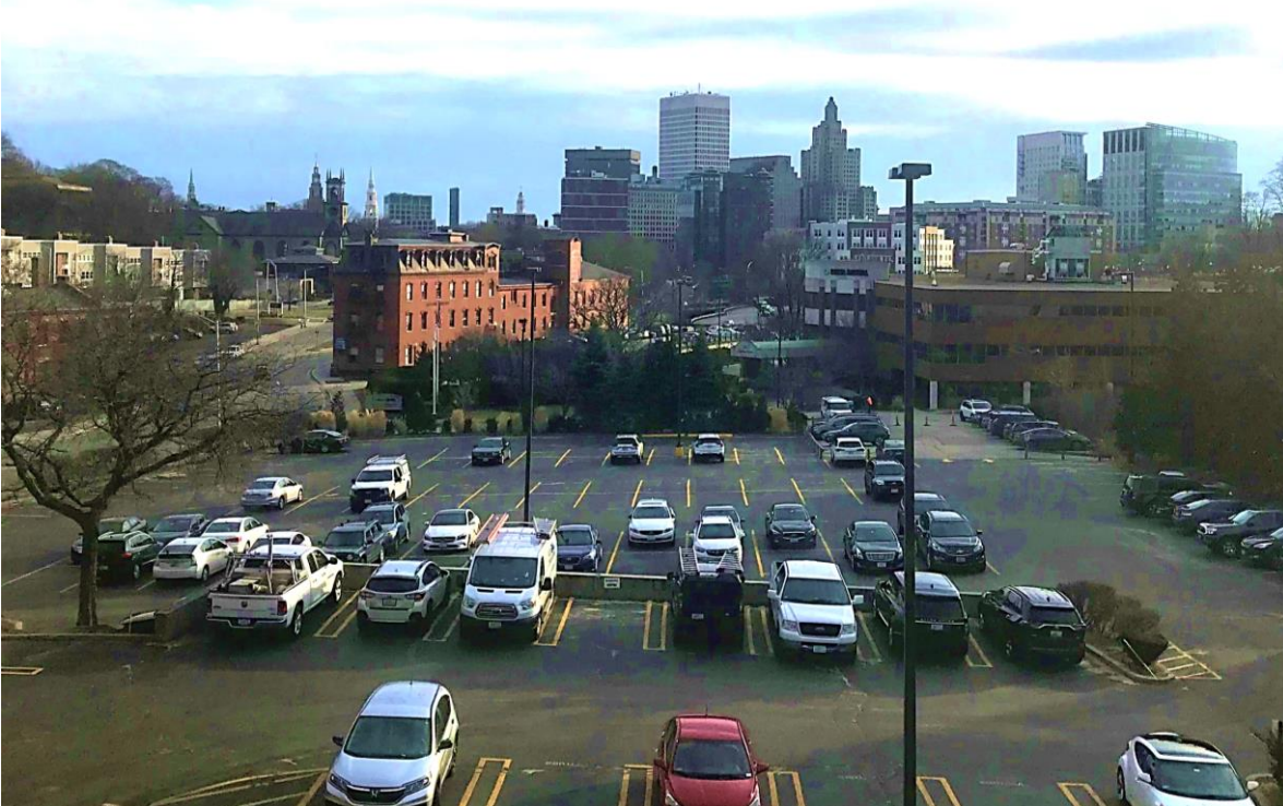
View from 4 th Floor

FOR LEASE 10 Orms Street Providence, RI 02904