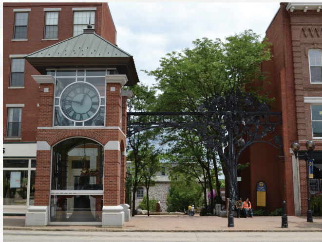
Walking Distance to Downtown Concord