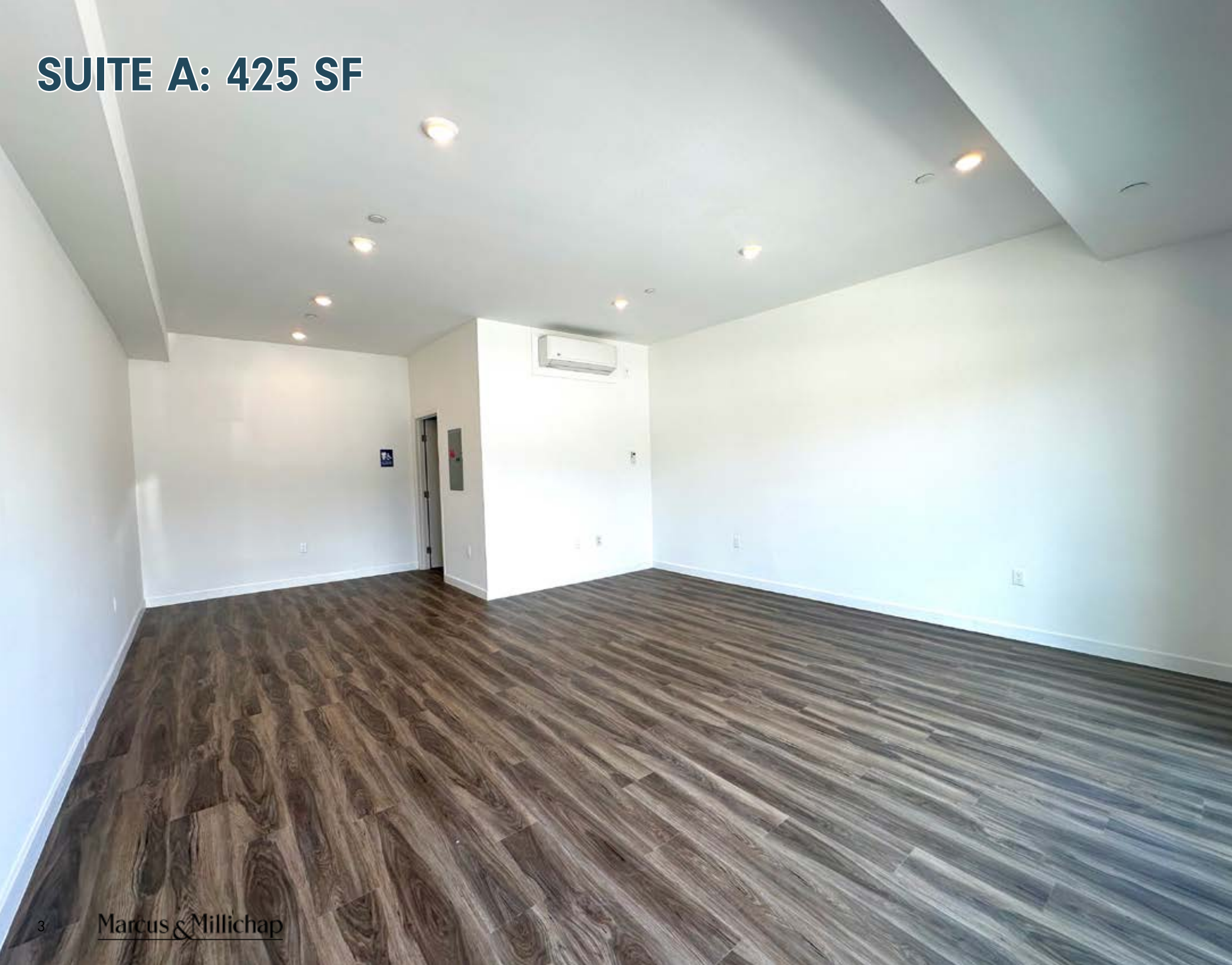
SUITE A: 425 SF