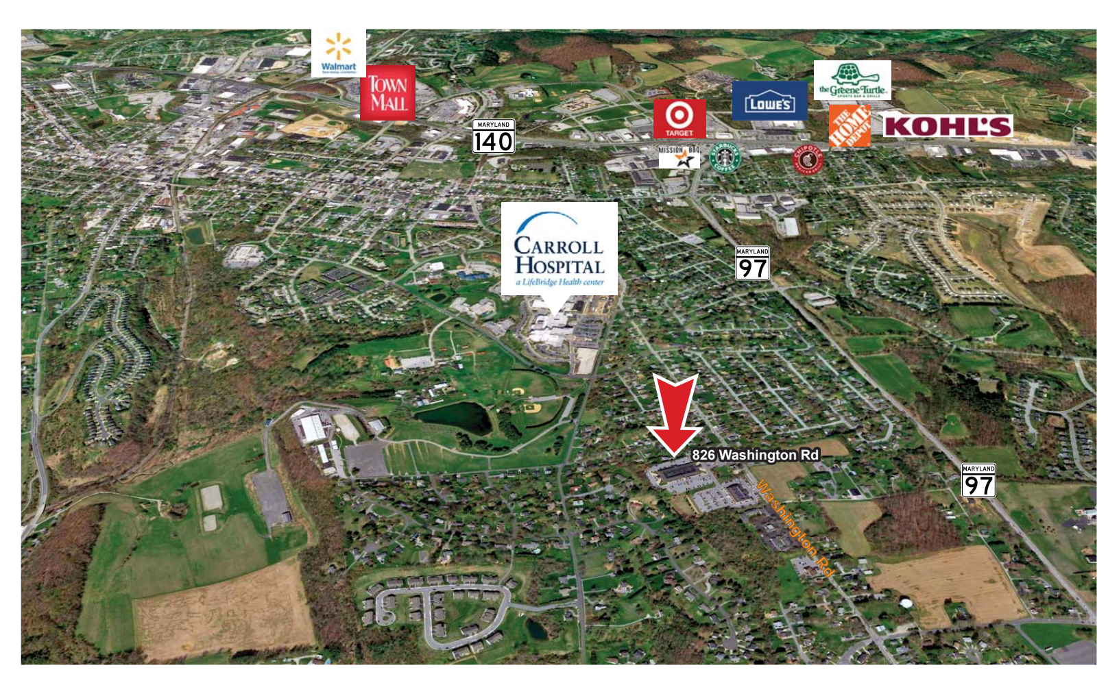
Information is from sources deemed reliable, but no warranty or representation is made to the accuracy thereof. Information is submitted subject to errors, omissions, prior sale, or lease withdrawal without notice.