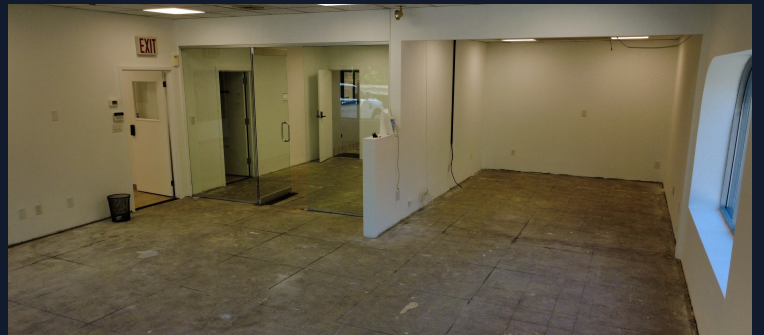
OFFICE / SHOWROOM SPACE