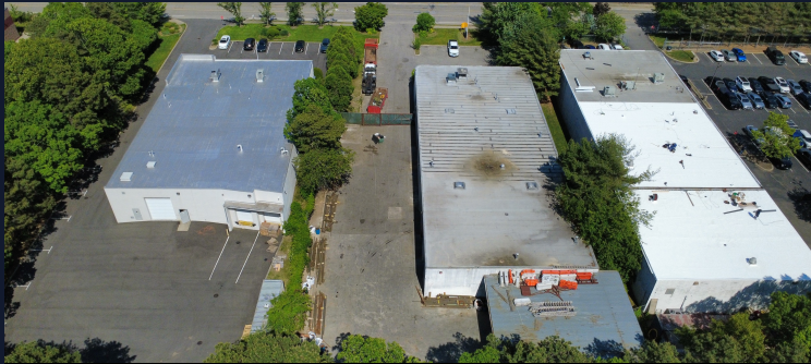
AERIAL VIEW · Site & Surrounding Area