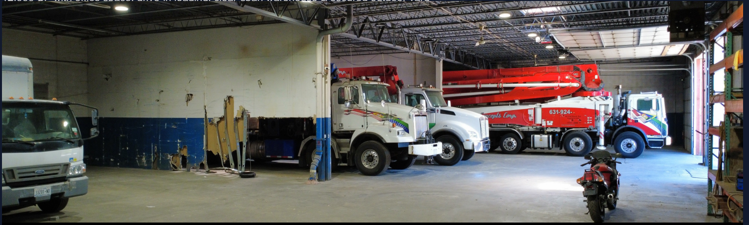
WAREHOUSE INTERIOR · 16' Clear Height · Drive-In Access

12,000 SF with office space, drive-in loading, clear-span warehouse & secured outdoor yard