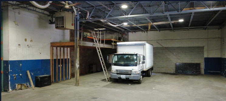
WAREHOUSE · Clear Span Interior