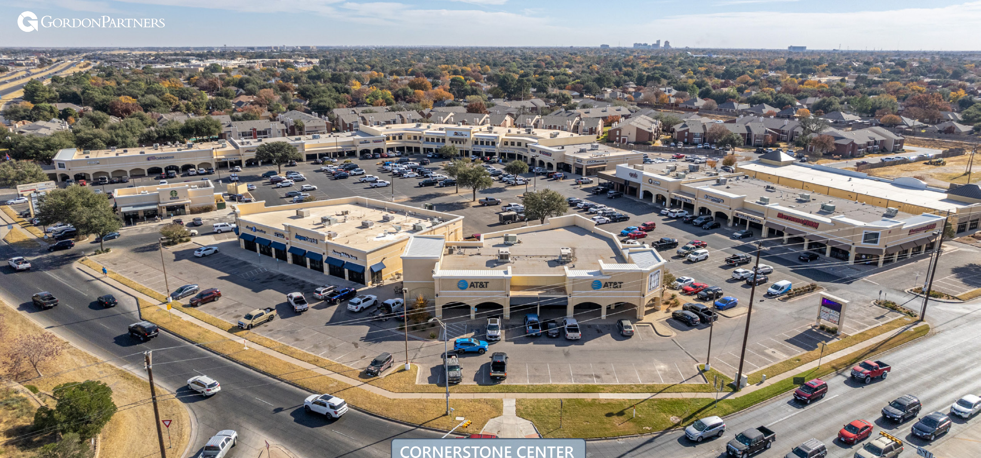
CORNERSTONE CENTER MIDLAND, TEXAS