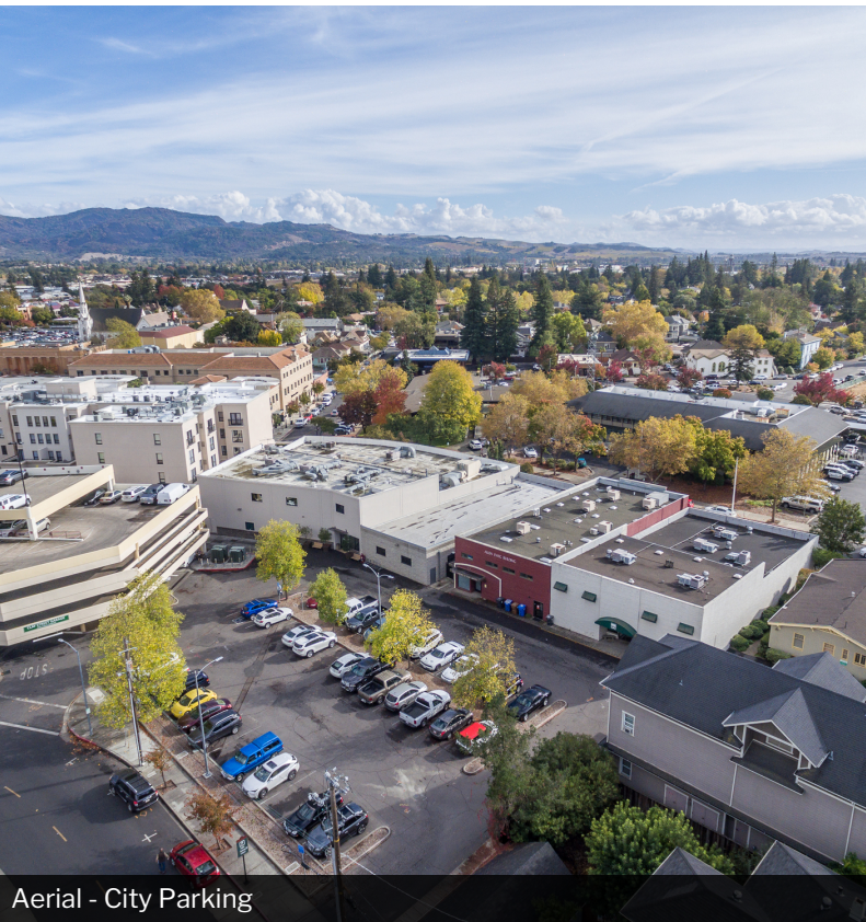
Aerial - City Parking