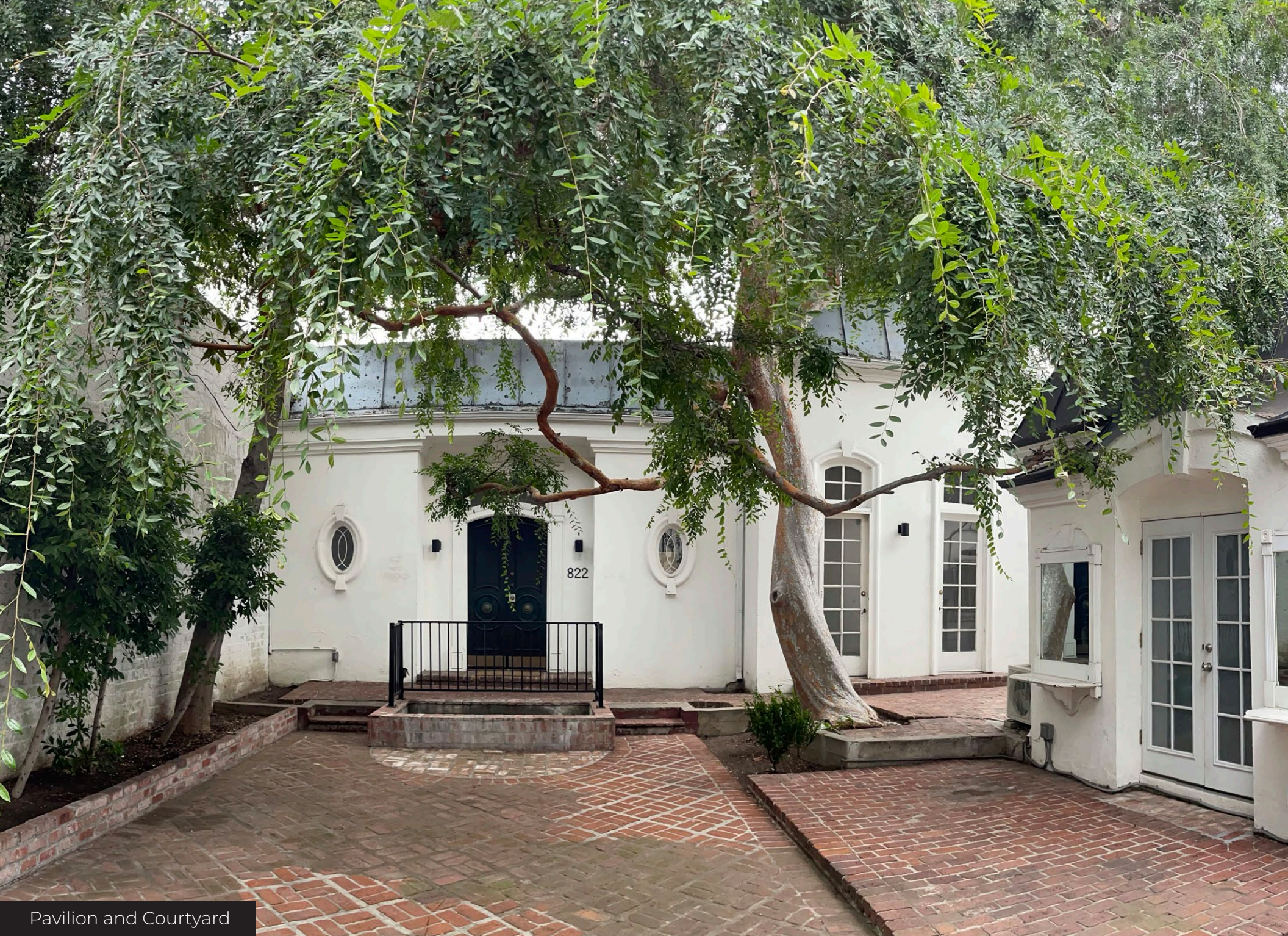
Pavilion and Courtyard