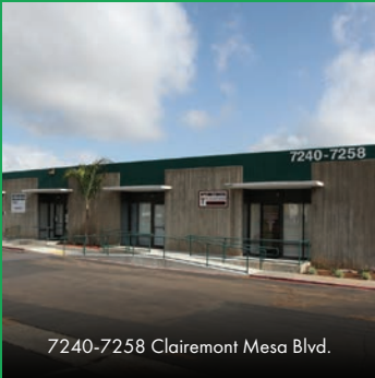
7240-7258 Clairemont Mesa Blvd.