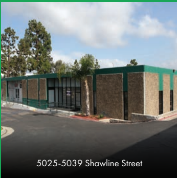
5025-5039 Shawline Street