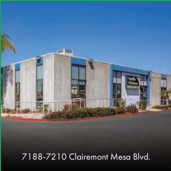
7188-7210 Clairemont Mesa Blvd.