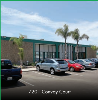
7201 Convoy Court

No warranty or representation is made to the accuracy of the foregoing information. Terms of sale or lease and availability are subject to change or withdrawal without notice.